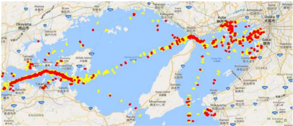
Figure 1. Closest points of approach.